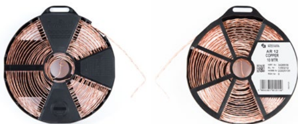
10 metre roll

Patentbands are available in the following lengths and packaging: