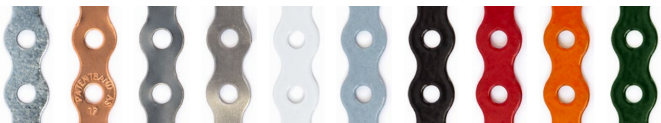
Galvanized/copper/stainless steel A-4/aluminium/white plastic/grey plastic/black plastic/red plastic/orange plastic/green plastic