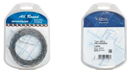
3 metre / 1,5 metre packaging